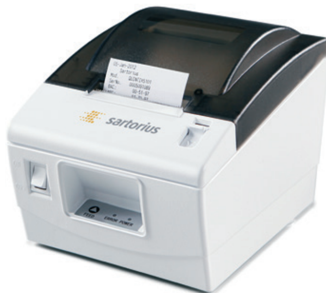
YDP40, Standard Laboratory Printer